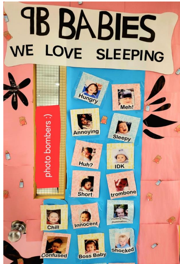
9B Door.